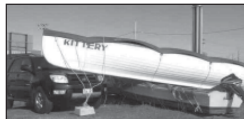
Kittery , December, 2009

Complete Icebreaker race results and photos that nearly capture the magic of the day are available on HLM's website: hulllifesavingmuseum.org .