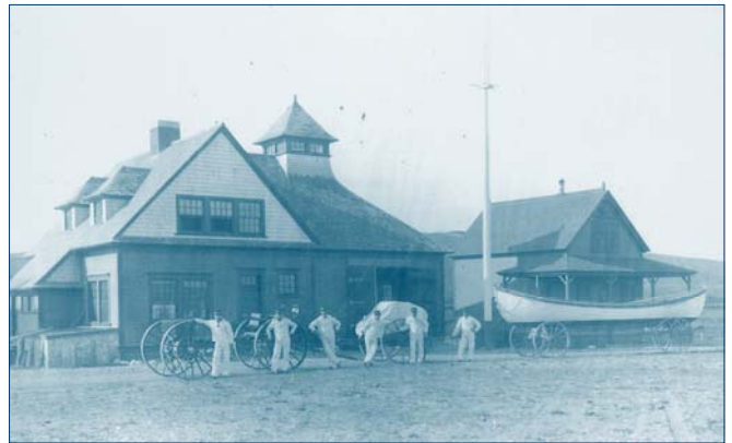
Hull Lifesaving Museum's Point Allerton Station has been on the National Register of Historic Places since 1981.

We are planning a total restoration of this important structure. Urgently needed work will start this summer with a new roof.